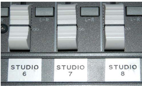
#6-8: Open to studio plays