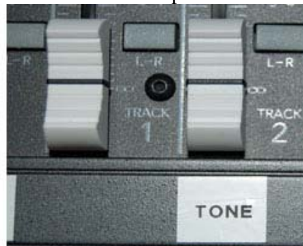
#9: OPEN & #10: TONE (tone generator)