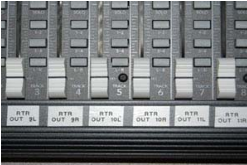
#11-16: L/R Output Channels from the mixer (9) and router monitors (10 & 11)

MAIN MIX SUB STATION: Inputs (bottom right corner of board)