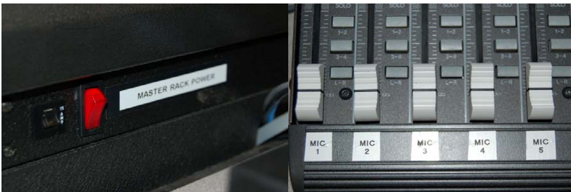
Master Rack Power

Everything is “on” as labeled and this board is wired to the “MASTER RACK POWER” switch (behind the Ross Switcher), so it will turn on and off with everything else.