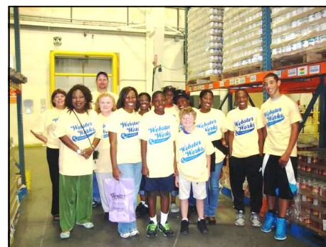
Webster-KC Alumni volunteered at Harvester's for Webster Works Worldwide!