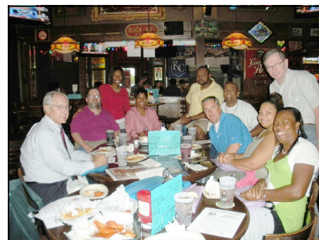
Webster-KC Alumni gather in September at Tanners in Waldo.