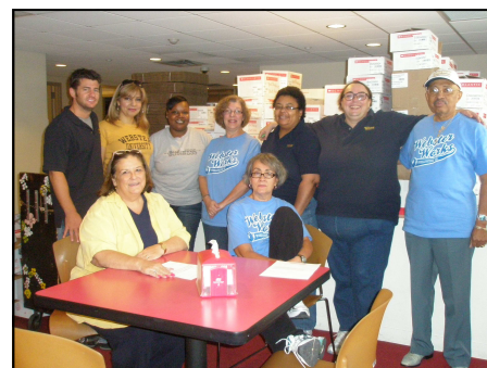
Staff volunteered at the KC Public Library for Webster Works Worldwide.