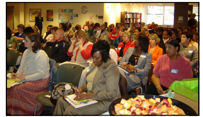
Nearly 100 teachers, parents and administrators from area public school districts attended Bridging Families, Communities, and Schools , a workshop sponsored by Missouri Literacy Investment for Tomorrow (LIFT) and Missouri Parent Information Regional Center (PIRC) held at Webster University on February 12th.